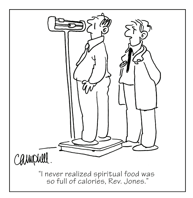
Copyright©2002 by Communications Resources, Inc. All rights reserved.